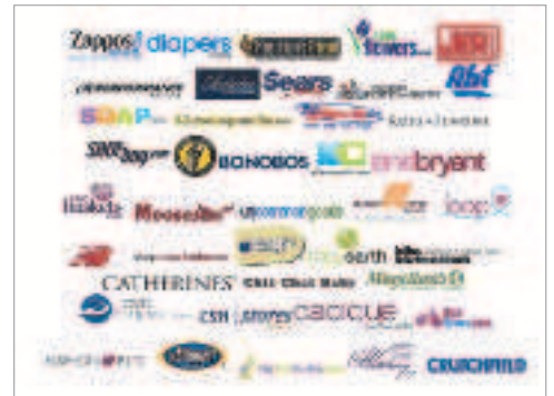
Expecting to close its second round of fund-raising shortly, the StellaService seal is now on 50 retail sites.

He called MyNines "disruptive," in that it is capable of changing the online user experience by "changing the entire industry and/or the shopping habits of the consumer. That's why venture capitalists are involved, because of the online strategy which automatically gives